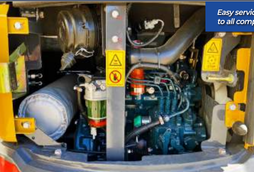
Easy service access to all componentry