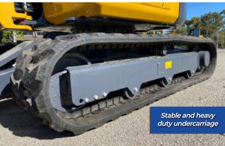
Stable and heavy duty undercarriage