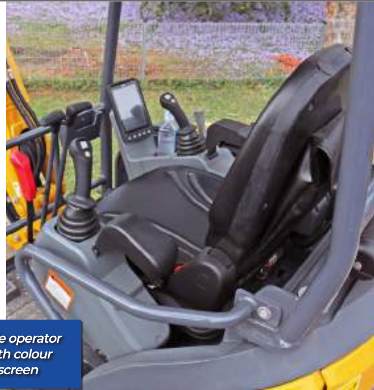
Comfortable operator station with colour display screen