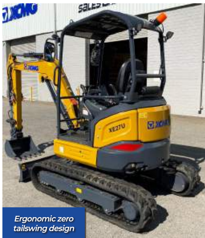
Ergonomic zero tailswing design