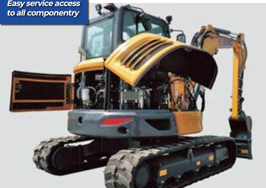
Easy service access to all componentry