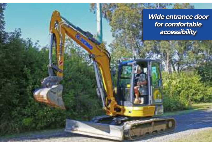
Wide entrance door for comfortable accessibility