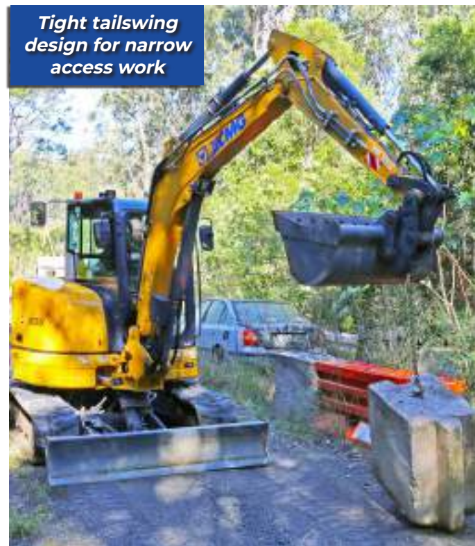
Tight tailswing design for narrow access work