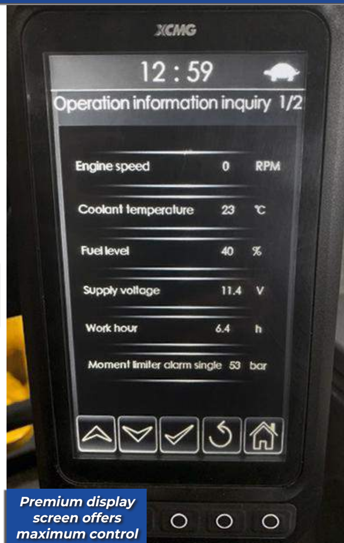
Premium display screen offers maximum control