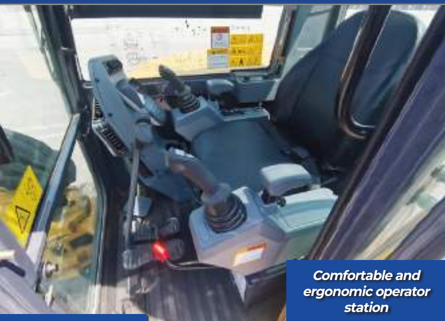
Comfortable and ergonomic operator station