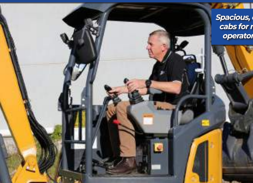
Spacious, ergonomic cabs for maximum operator comfort