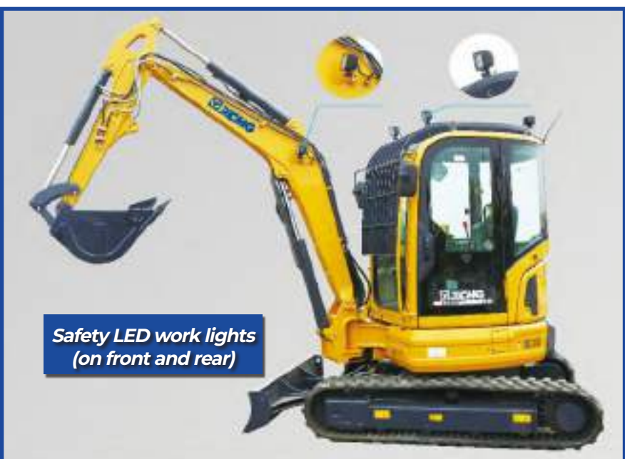
Safety LED work lights (on front and rear)