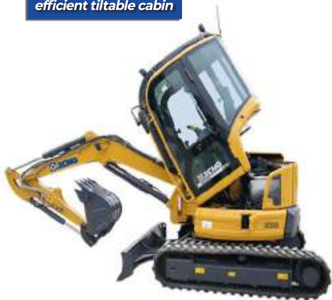
Fuel and hydraulic oil are easily replenished thanks to the XE35U's efficient tiltable cabin